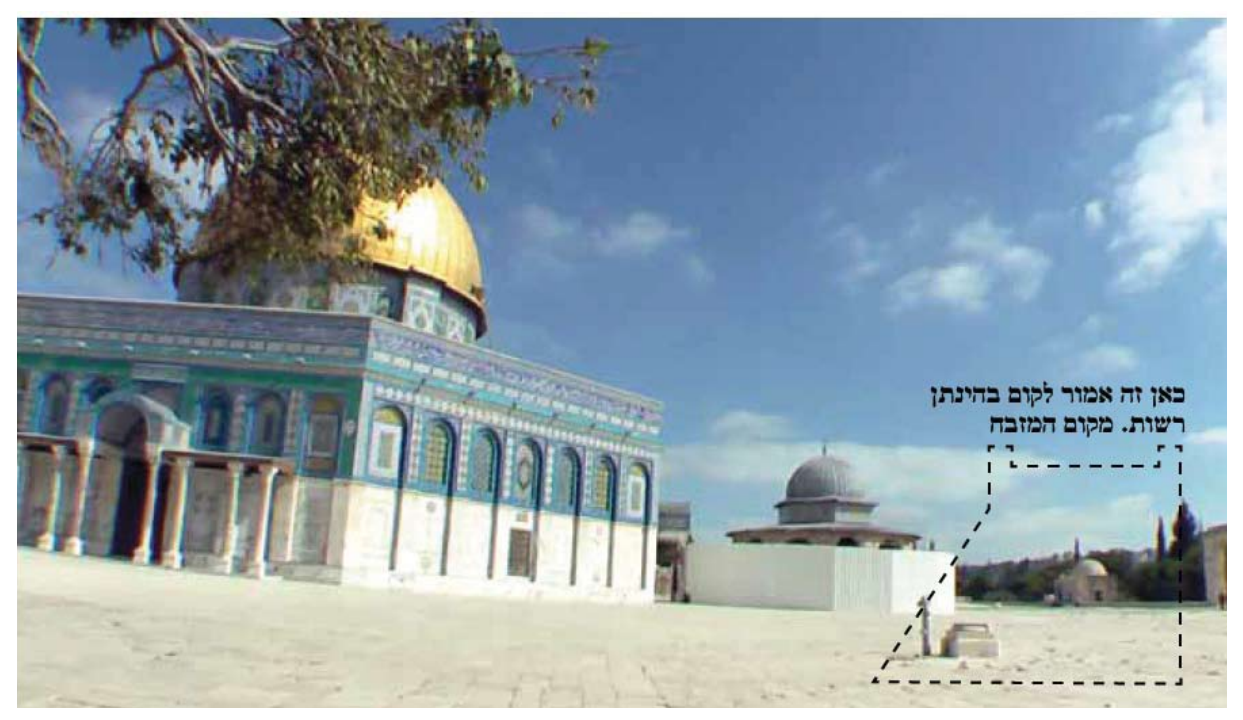
[The text reads: This is where it should be placed when permission is given. The site of the altar] Caption: This illustration was published in Makor Rishon on December 7, 2012, in Arnon Segal's section "Amud Habayit", under the headline "Inauguration of the Altar."

namely, the sacrifice sacrament. Phrases such as "temporary prevention" and "as soon as the gates of the Temple Mount open" point to the immediate hope of the Temple Institute to formally utilize the sacred vessels they have prepared. As of December 2012, the altar was almost ready and the Temple Institute was preparing to display it to the public in a new exhibit targeted for a February 2013 opening.<sup>64</sup>