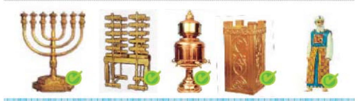
התמונות (והכלים) באדיבות מכון המקדש

From Daf Habayit, a weekly section on the Temple Mount in Makor Rishon , December 22, 2011: