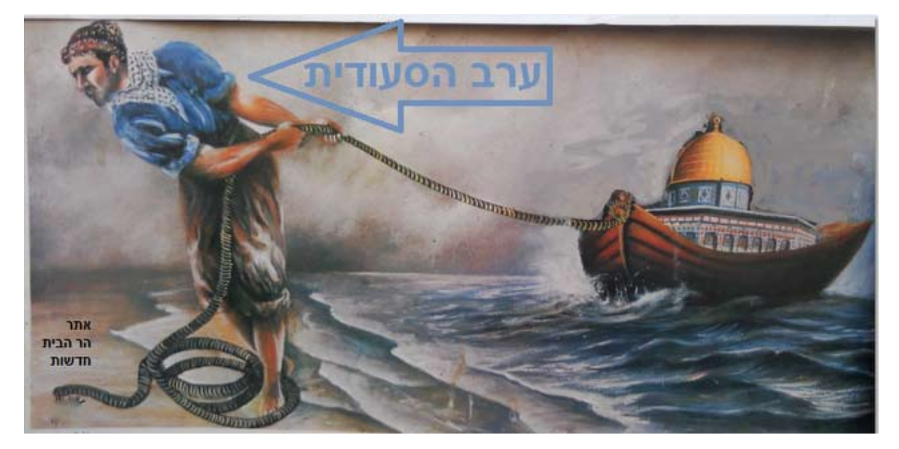
5The text in the arrow reads "Saudi Arabia".