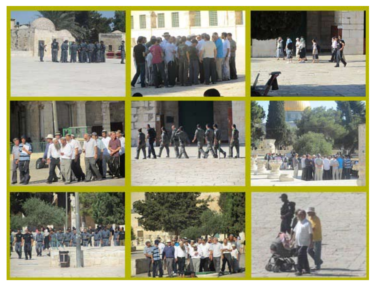
Pictures of groups of pilgrims, rabbis and soldiers in uniform, published on Arab websites

In recent years, the Islamic press has frequently reported on groups of uniformed Israeli soldiers entering as tourists and touring the Mount complex. Such acts are seen as an Israeli provocation and an attempt to change the arrangements in force on the Mount, according to which Israeli security forces are allowed to enter the complex only to protect order and security. On August 28, the Al-Aqsa Institute of Waqf and Heritage issued an official statement accusing Israel of violating the sanctity of the Al-Aqsa Mosque by allowing the very presence of non-Muslims at the site. According to the statement: